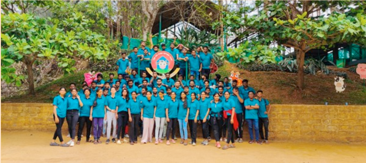
Students during Out Bond Experiential learning(OBEL) at Big barn nature camp, Bengaluru