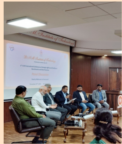
Panel discussion on strategic agility and resilience