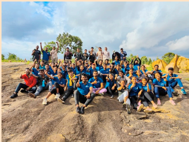
Students at Mutthurayaswamy Hills as part of OBEL

In summation, the OBEL program for BNMIT's MBA students delivered a holistic and enriching experience that extended beyond the classroom. With a comprehensive blend of theoretical insights and practical applications, the program seamlessly merged critical thinking, teamwork, and adventure into an invaluable learning journey. The participants emerged not only with newfound knowledge and skills but also with a profound sense of achievement and personal growth. This 3rd edition of the OBEL program undoubtedly stands as a testament to the institution's commitment to providing its students with unparalleled opportunities for holistic education and experiential learning.