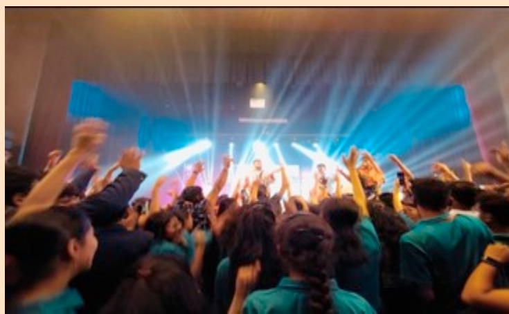
Audience celebrating the Mega Event by the band "Lohar - The Blacksmiths"