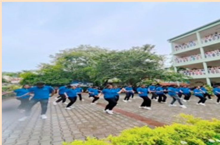
Students performing flash mob dance