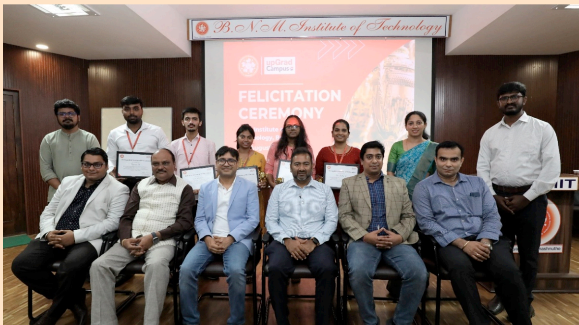
The top performer students with the Management of BNMIT and the Upgrad campus representatives