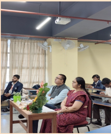
paper presentation in the general Management Track