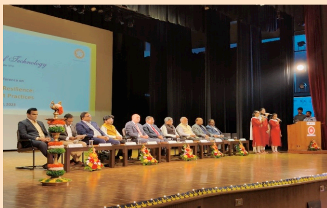
Inauguration of the 6th ICIER International conference