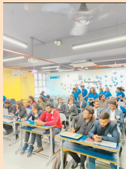
Students performing the assigned tasks y in best manager Event - Futuro master