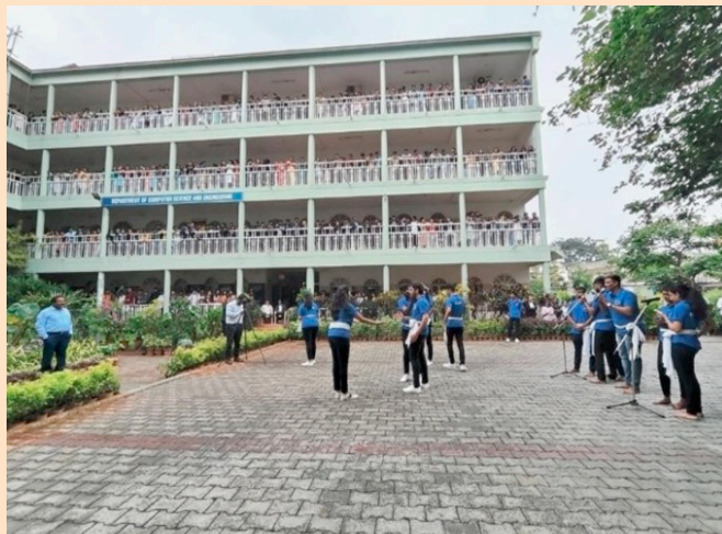
Students performing skit

“Aarohan” is an annual college fest organized by Department of business administration of BNMIT. It is a highly anticipated event that brings together students from various colleges and universities to showcase their talents, participate in competitions, and enjoy a vibrant cultural extravaganza. The fest aims to provide a platform for students to exhibit their skills, foster a sense of camaraderie, and promote cultural exchange. The theme of Aarohan 2023 was City of future. The fest started on 6th July 2023 by welcoming the dignitaries followed by invocation. Next, there was a skit and the flash mob. Undergraduate events were held on 6th and Postgraduate on 8th July 2023.