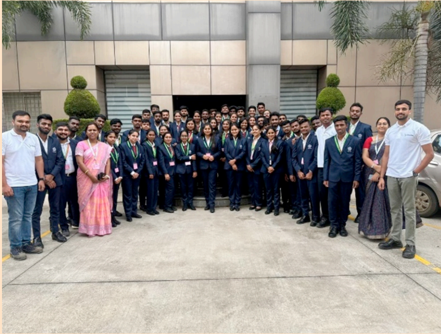
Students at BIESSE manufacturing unit along with the coordinators during the Industrial visit

Overall, the industry's operating function was well understood by the students. Each task and step in the shop floor was well explained by the guides. A overview of the practical application of management functions were seen and observed.