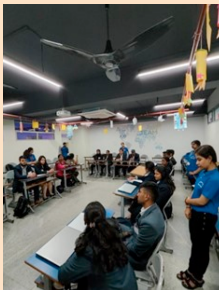
Students actively participating in HR Event - Lunar Terrestrials